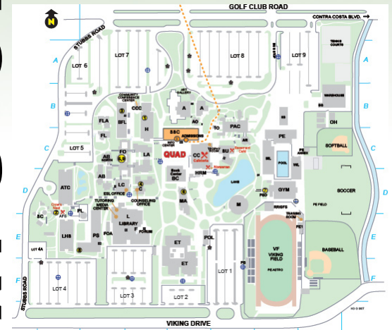
Pleasant Hill Campus map